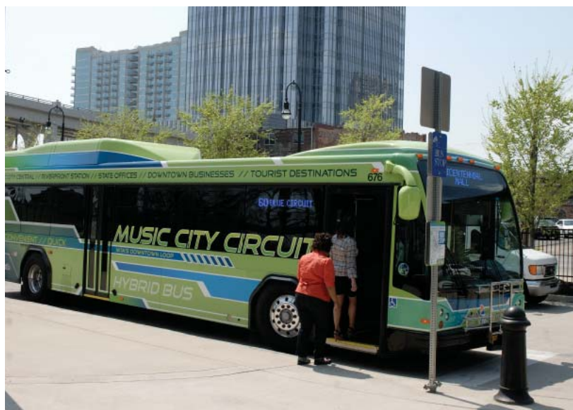
The new Music City Circuit hybrid bus picks up customers at Riverfront Station.

Music City Star customers also have the option of boarding several other MTA buses at Riverfront Station. Route 93 Music City Star West End Shuttle uses Bay 3, and Routes 6 Lebanon Road, 25 Midtown and 44 MTA Shuttle use Bay 4.