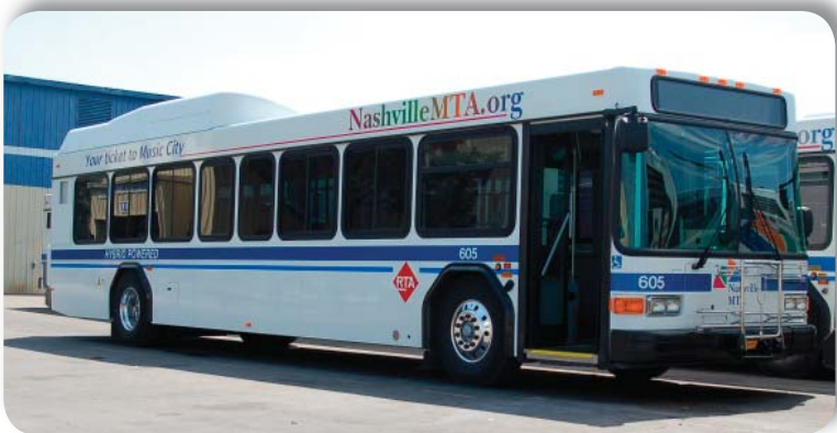
Two new hybrid powered buses have been added to Route 96X Nashville/Murfreesboro Relax & Ride. This bus and others assigned to this route are part of a WiFi pilot project that is in the testing phase.